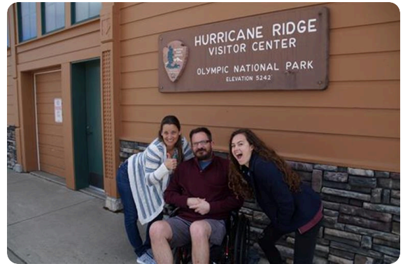
We're here and ready for adventure!