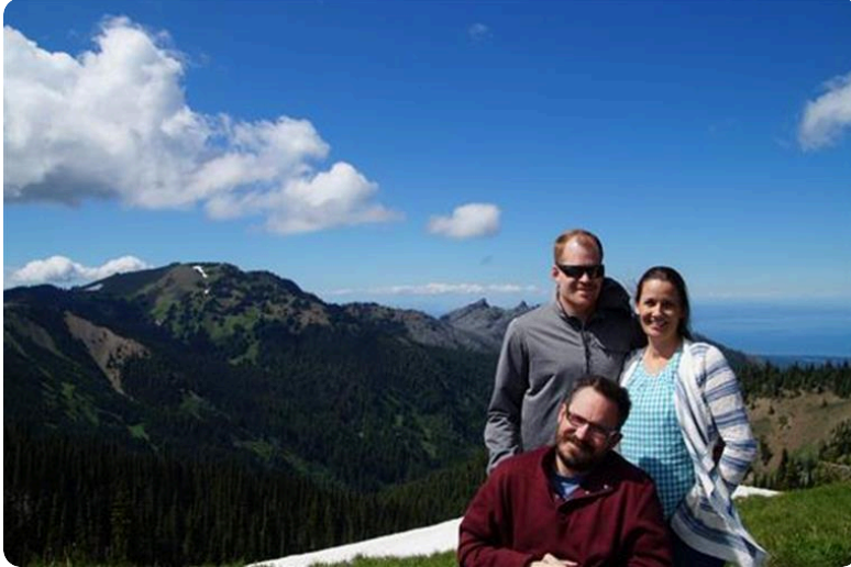
Hurricane Ridge viewpoint