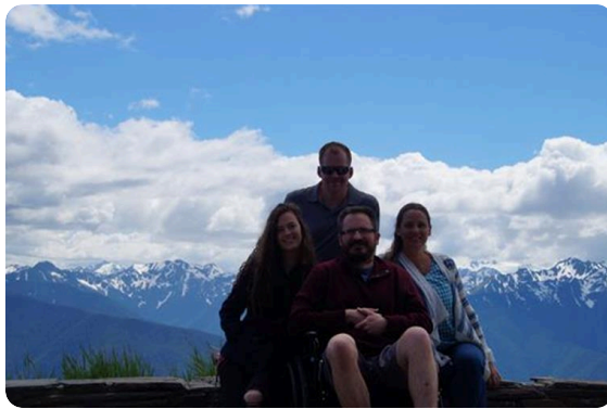
Viewpoint from behind the visitor center