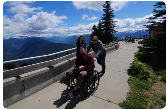
Every bit as fun going up as it is to go down!